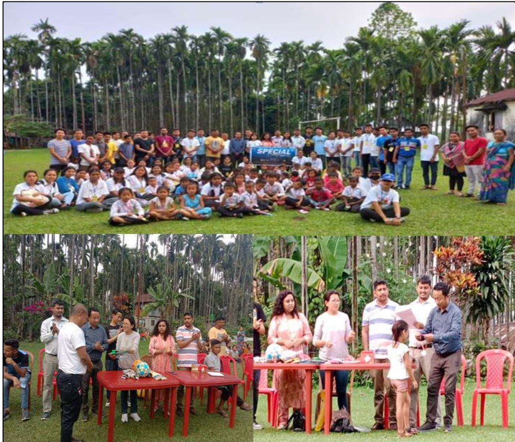
Fig. NSS Programme Officer, other Faculties and the volunteers of NSS Unit-1 distributing sports goods and spreading awareness on health and hygiene.

3. Environment Conservation and awareness activity: NSS unit has been promoting environment conservation and awareness activity right from its inception. Cleanliness Drive in and around the College has been a regular extension activity of the unit. Apart from regular cleaning activity within the campus the Unit has carried cleanliness activities to BPHC, Lower Fagu Primary School as well.