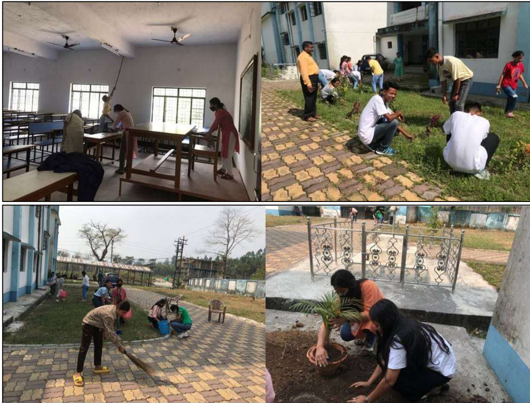
Fig. Cleaning and Planting activities carried out by the volunteers